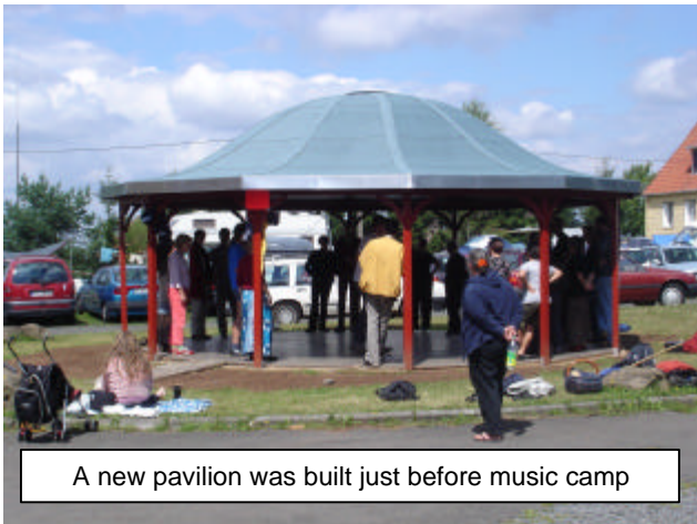
A new pavilion was built just before music camp

grounds and 80 in our two guest houses. This Music-Camp went on for 8 days and offered about 50 different work shops from harp over trumpet to drums. Because of many non Christian participants we had the chance to build up Christian friendship and witness to many of them.