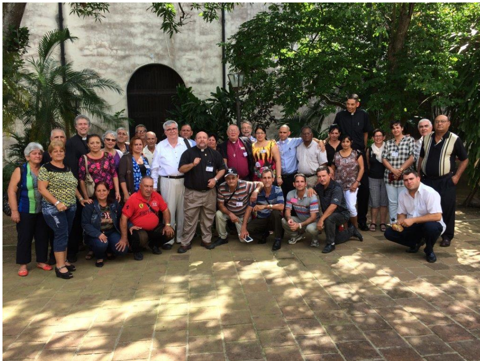
MISSION TEAM &amp; 2018 SYNOD PARTICIPANTS